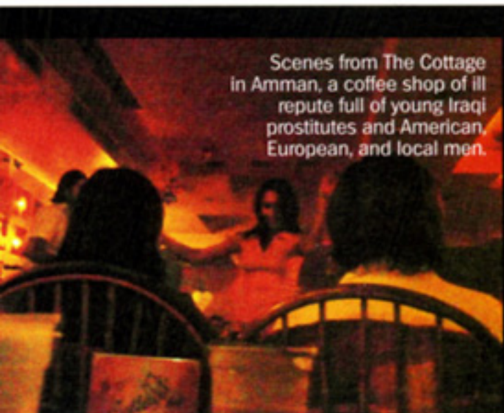
Scenes from The Cottage in Amman, a coffee shop of ill repute full of young Iraqi prostitutes and American, European, and local men.

A LTHOUGH PROSTITUTION has long existed in Amman, that job is now being filled by Iraqis. Since the U.S. rolled into Baghdad in 2003, more than 2 million people have fled Iraq. Most live in Syria and Jordan and await official resettlement to someplace safe, where they can work. A fraction have found new homes this way in Sweden, Australia, and The Netherlands, and around 6000 in the U.S.—but it can take years. Only 5000 of the 750,000 Iraqis who have come to Jordan have been resettled. In the meantime, the